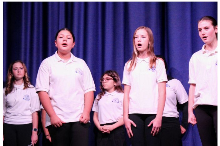
Viking Voices Acapella Group performed at the VCMS winter concert for our school community.