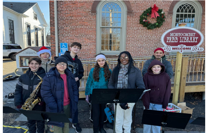
Musicians from the VCMS Select Chorus and Chamber Music Ensemble spread holiday cheer in the Village of Montgomery.