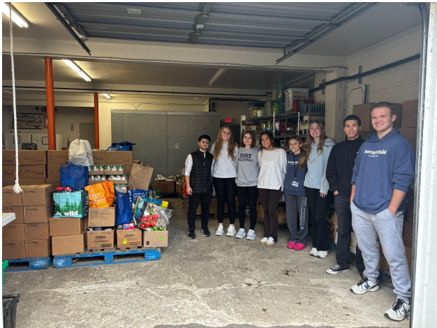
The Senior Class sponsored a food drive at the high school and was able to fill five cars with food for the Montgomery Food Pantry!