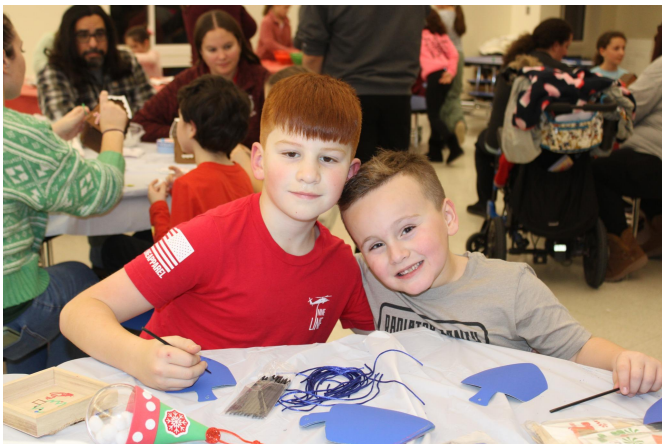
The EC PTA Winter Holiday Craft Night was a wonderful evening filled with creativity, holiday spirit, and community fun.