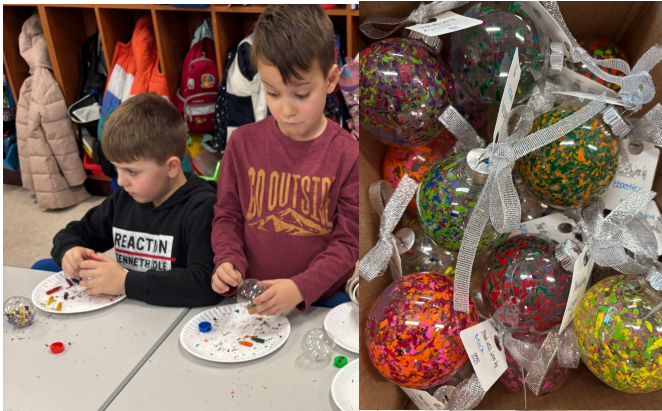
MES third graders worked with kindergarteners to make ornaments to give as gifts.