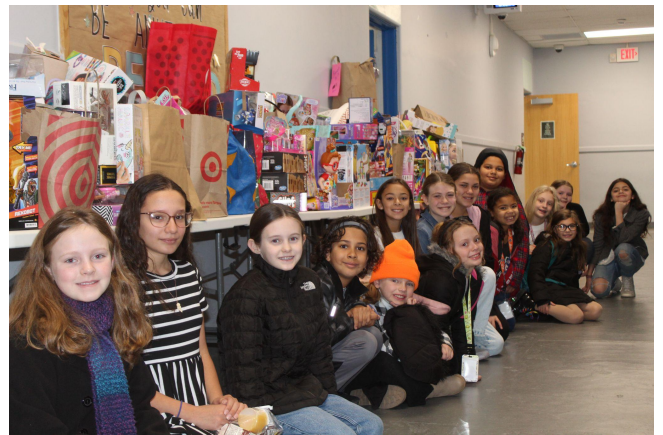
The student council at WES collected over 400 toys for Operation Dalmatian, which will distribute them to children in Orange County!